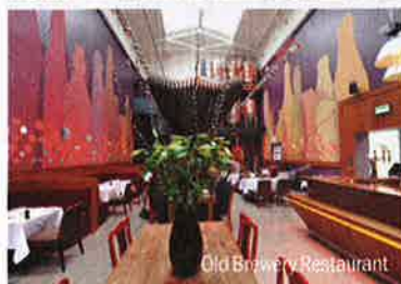
Old Brewery Restaurant