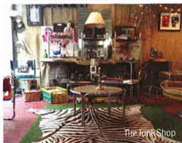
The Junk Shop